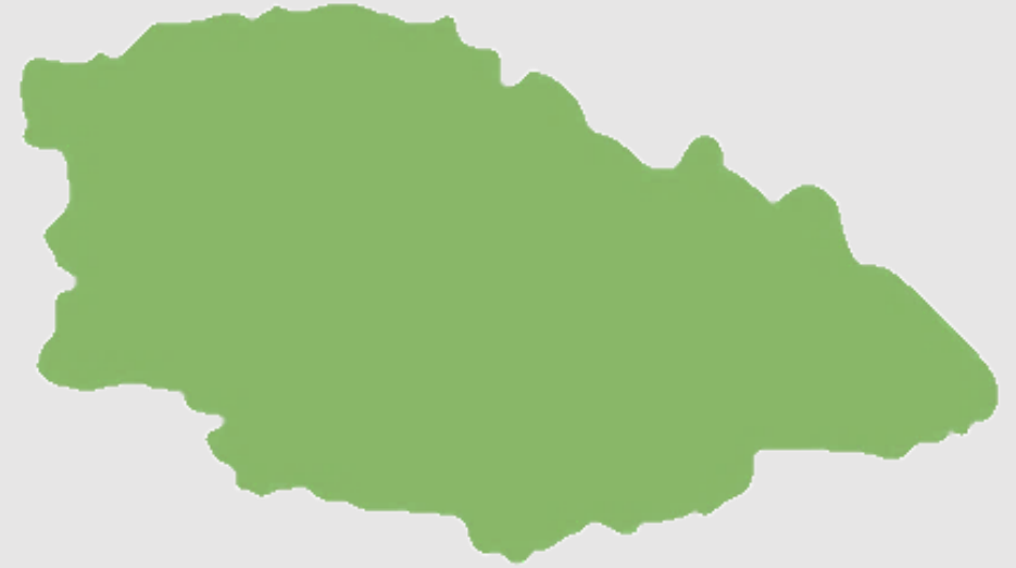
Gozo To Scale